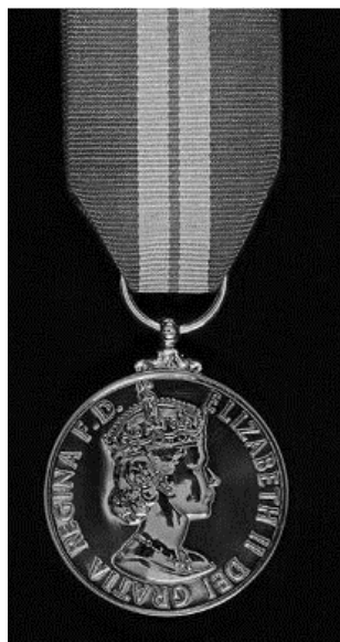
Queen's Gallantry Medal